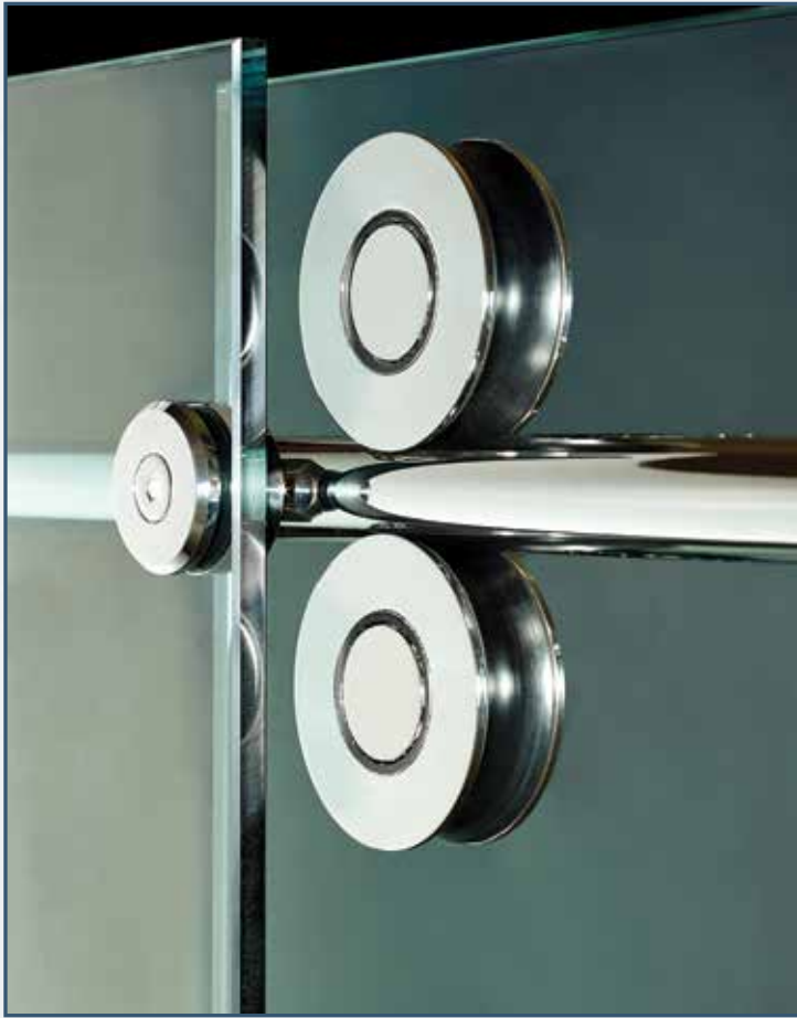
RUNNING RAIL WITH ROLLERS