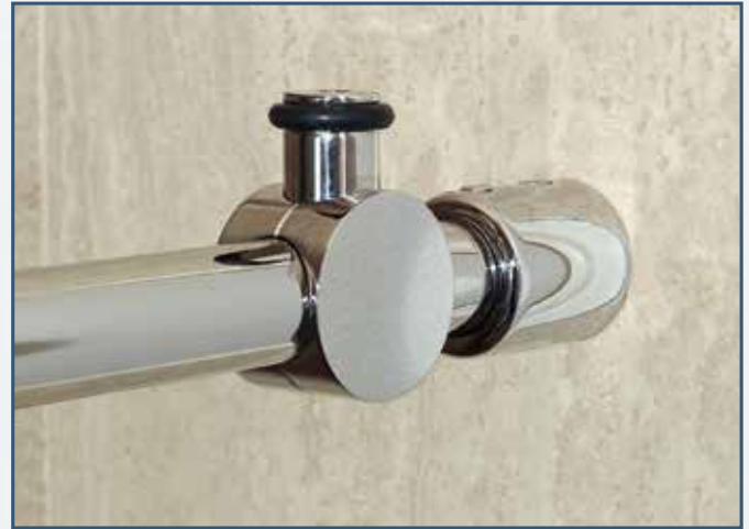
STOP AND WALL MOUNT