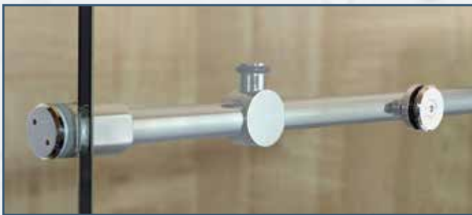
90° PANEL ADAPTER