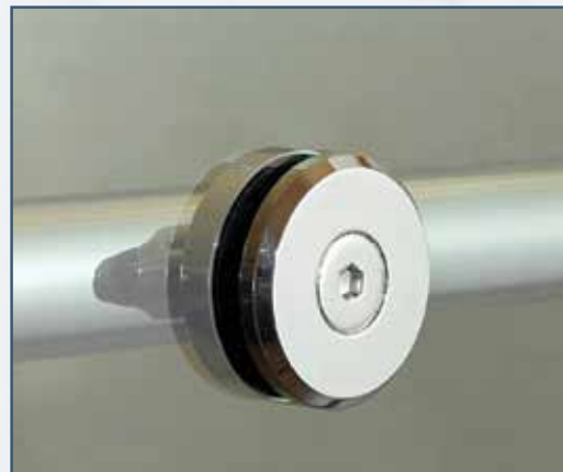
GLASS MOUNT BAR CLAMP